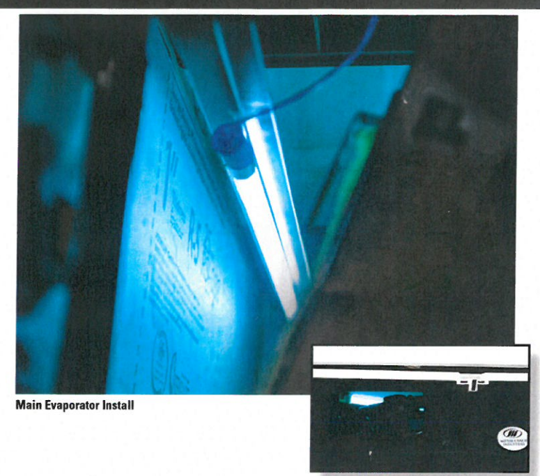
Parcel Rack Install

Durable, cost effective and reliable. Offers an improved safety focused environment for drivers and passengers.